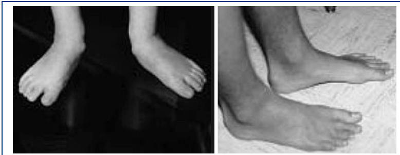
A child at age 3 years (left) with flexible flatfoot. The same child at age 15 years (right) has a normal arch despite having received no treatment.

Additional treatment. Your doctor may prescribe physical therapy or casting if your child has flexible flatfoot with tight heel cords.