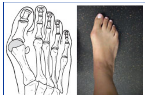
A bunion is a bony knob that protrudes from the base of the big toe.

Hammer toes occur when the toe starts to curl up instead of lying flat. The middle toe joint will bend up and if you have your foot in a tight shoe, it will rub up against the shoe surface and cause pain. In addition, the muscles that attach to the toes will continue to weaken if the foot stays in this abnormal position.