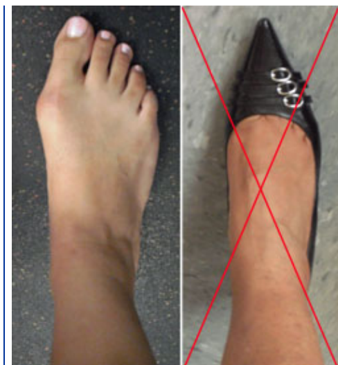
The goal is to find a shoe that approximates the shape of your foot - rather than for your foot to take on the shape of the shoe.

For more helpful guidelines about choosing proper footwear: Shoes: Finding the Right Fit ( topic.cfm?topic=A00143 )