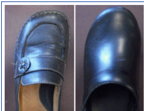
Wear shoes and socks that fit and give your toes plenty of room.