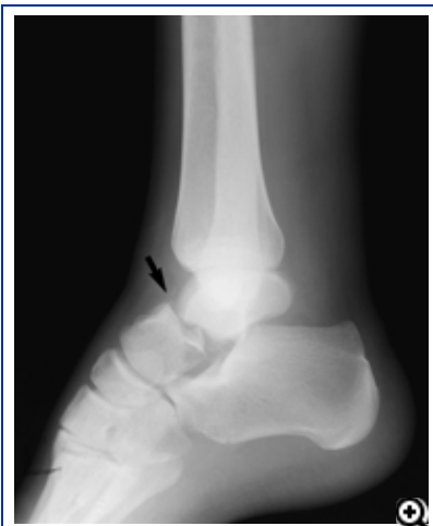
An x-ray of a talus neck fracture.