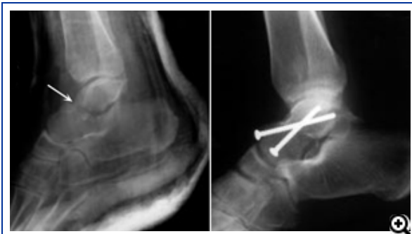
(Left) This x-ray shows a talus fracture. (Right) The bone fragments are fixed in place with screws.

Open reduction and internal fixation. During this operation, the bone fragments are first repositioned (reduced) into their normal alignment. They are then held together with special screws or metal plates and screws.